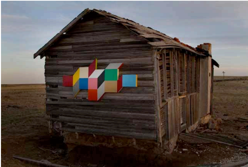
Pard Morrison, Saul's Universe (installed), 2012 fired pigment on aluminum, 45 x 93 x 3.25 inches

Opening Reception: Friday, May 18, 5:00-7:00 pm Exhibition Dates: May 18, 2012 - June 23, 2012 Contact: James Kelly: jim@jameskelly.com