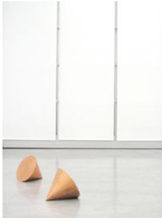
Pair Object VI , 1990. Solid forged and machined CR copper. Two units: 13" diameter x 11" length.