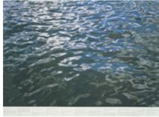
Still Water (The River Thames, for Example) - Image L , 1999. Offset lithograph (photograph and text combined) on uncoated paper. 30 ½ x 41 ½".

James Kelly Contemporary is located at 1601 Paseo de Peralta, Santa Fe, NM 87501. Gallery hours for the duration of this show are Tuesday through Friday from 10:00-5:00 p.m. - Saturday from 12:00-5:00 p.m. - Monday by appointment. Please call the gallery at 505.989.1601 - fax 505.989.5005 - email hannah@jameskelly.com for more information.