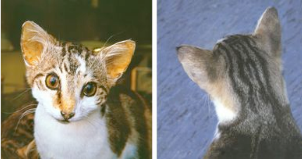
Roni Horn. Untitled (Kitty Cat) , 2000. Two photographs on polyester, framed separately. 30 x 30".