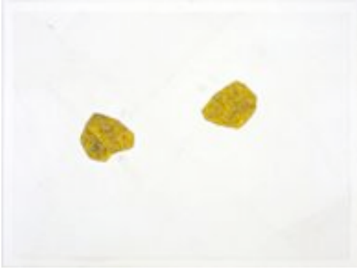
The XXVIII , 1988. Pigment and varnish on paper. 26 ¼ x 36".