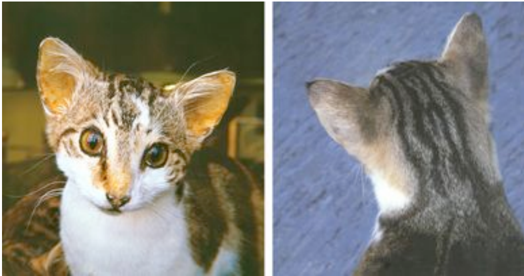
Roni Horn. Untitled (Kitty Cat) , 2000. Two photographs on polyester, framed separately. 30 x 30".