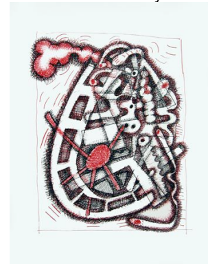
2 color lithograph 15-7/8" x 12-5/8"

Gemini G.E.L. has collaborated with famous artists nationwide to help ACT defeat George W. Bush and elect democrats in federal, state and local elections in 2004. This unique fundraising effort will reward donors with a gift of a limited edition print of their choice as a show of gratitude for a generous contribution to ACT. All of the featured pieces are signed originals commissioned expressly for America Coming Together and 100% of your contribution will benefit ACT's work in the 2004 elections. The portfolio includes prints donated by the following artists: