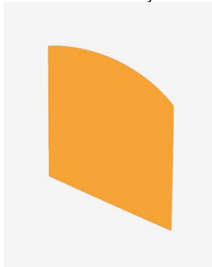
1 color lithograph 16" x 12"